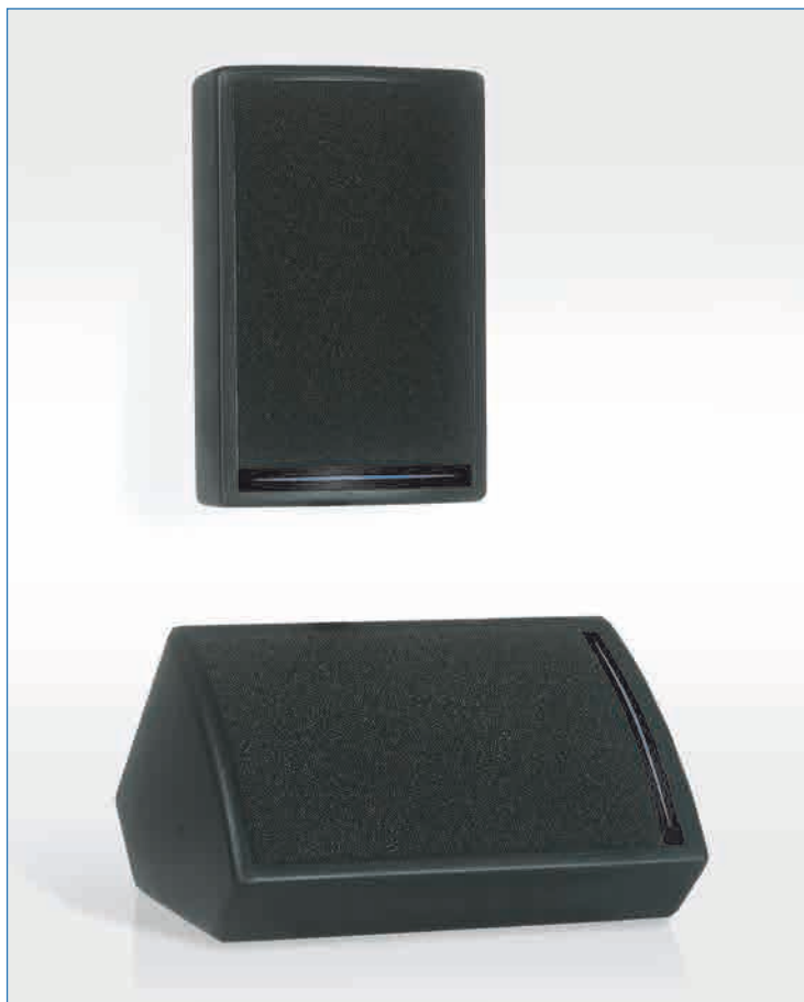
MC1 shown in FOH and stage monitor settings

The MC1 offers total flexibility between stage monitor and F.O.H applications, with or without subwoofers. This speaker stands out by its extreme reliability and vocal performance.